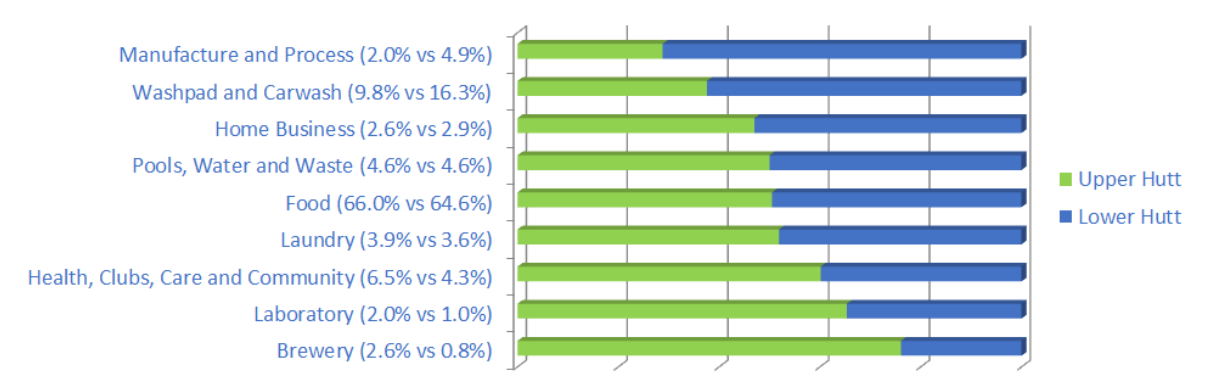
Figure 2: Ratio of total trade waste discharge type (relative to total consented premises) - Upper Hutt vs. Lower Hutt

The overall ratio of business type is fairly consistent through the two cities we monitor, with Lower Hutt having relatively more manufacture, process and automotive outfits, while Upper Hutt has a higher ratio of health, clubs, child, elder care & after-death care, laboratories and commercial brewing outfits.