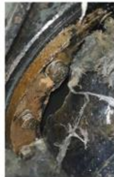
Leaking Pump Discharge Manifold