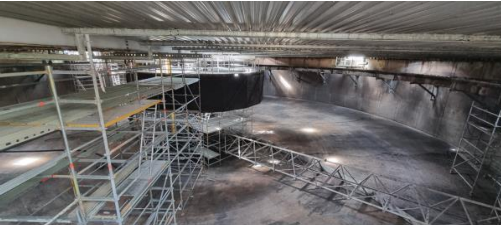
(Inside of Clarifier 2 post initial clean)

Current status The 3rd clarifier is currently offline, and work is in progress to refurbish.