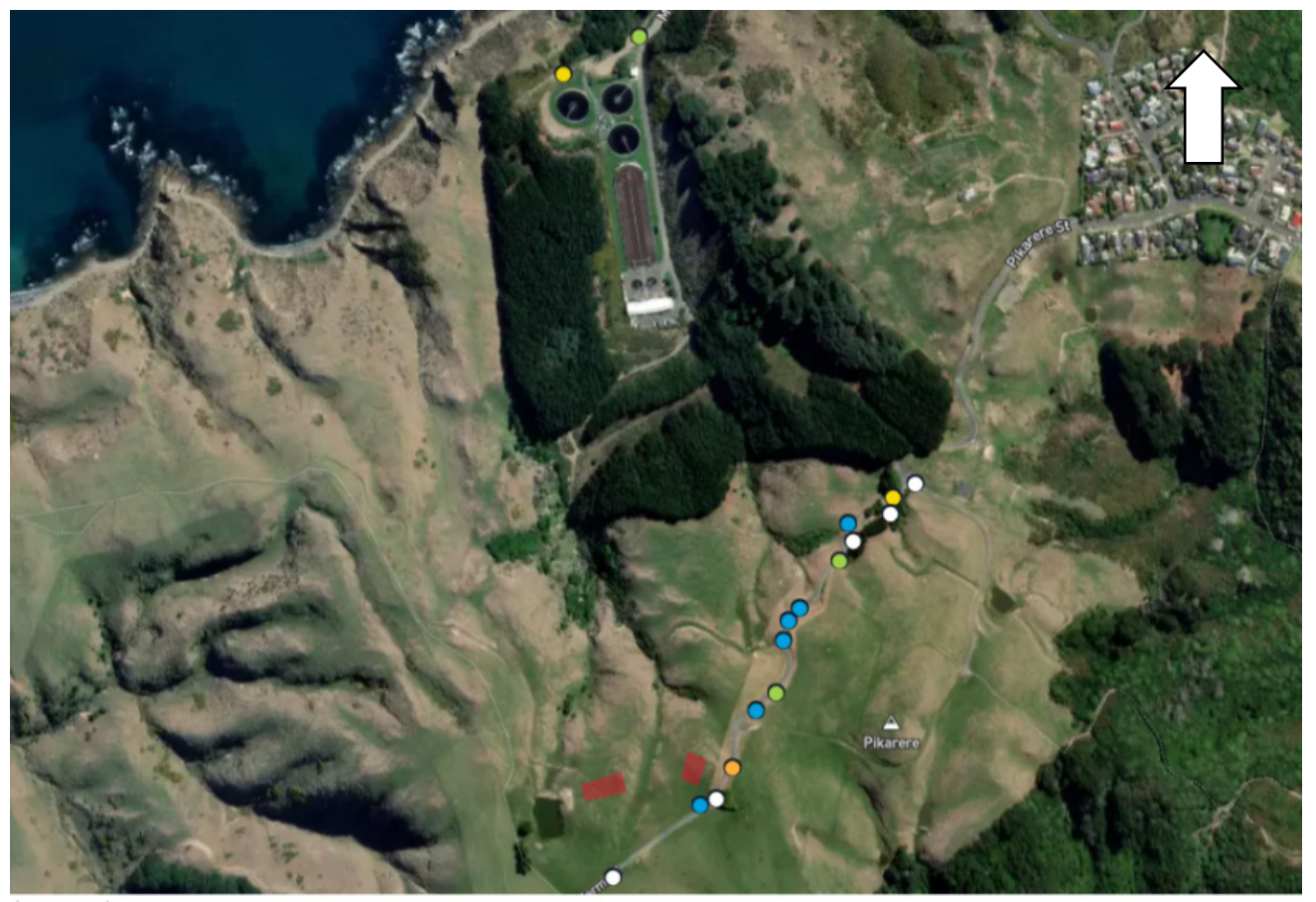
generated by plumemapper.com.au