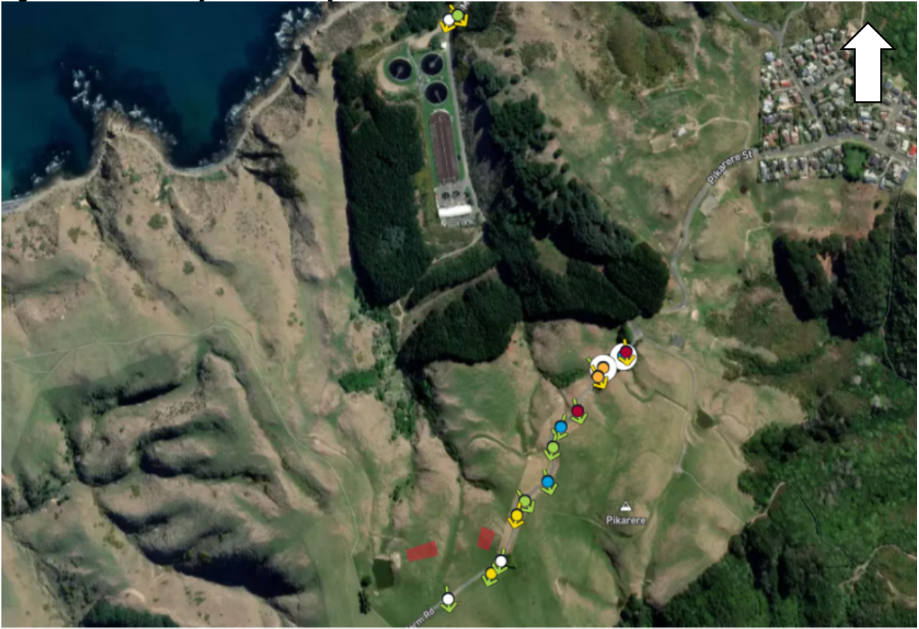
Figure 2: Odour Survey Results – Day 1

Other odours detected were of a character defined as 'grass', 'plant smell', and 'animal/farm' at 'weak' intensities for fleeting periods.