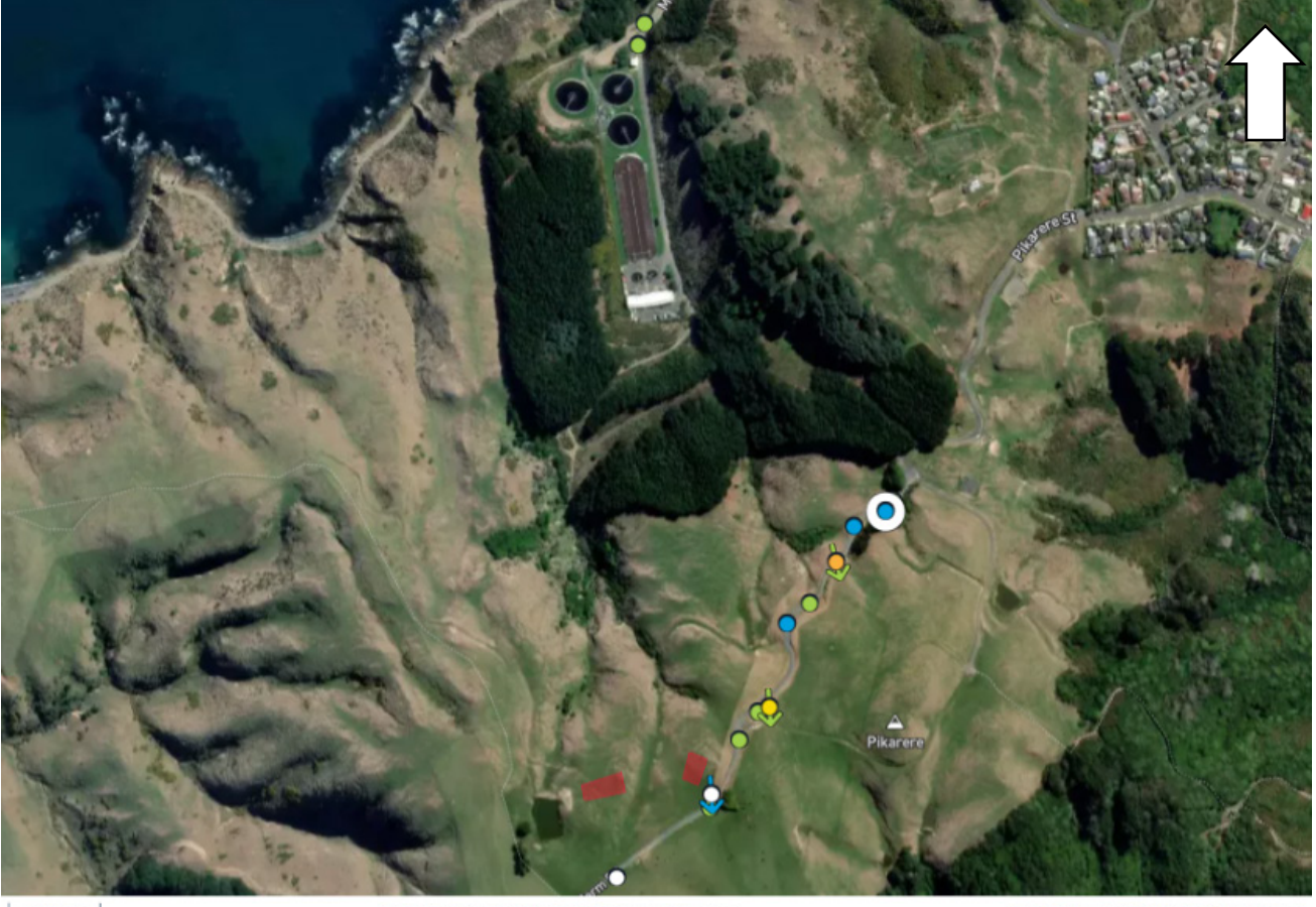
generated by plumemapper.com.au