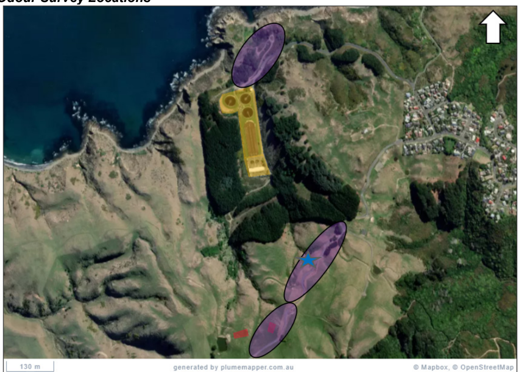
Figure 1: Odour Survey Locations

Figure 1 shows an aerial of PWWTP (yellow polygon), receptors located on Pikarere Street (red polygons), and areas frequently visited during the odour study (purple areas).