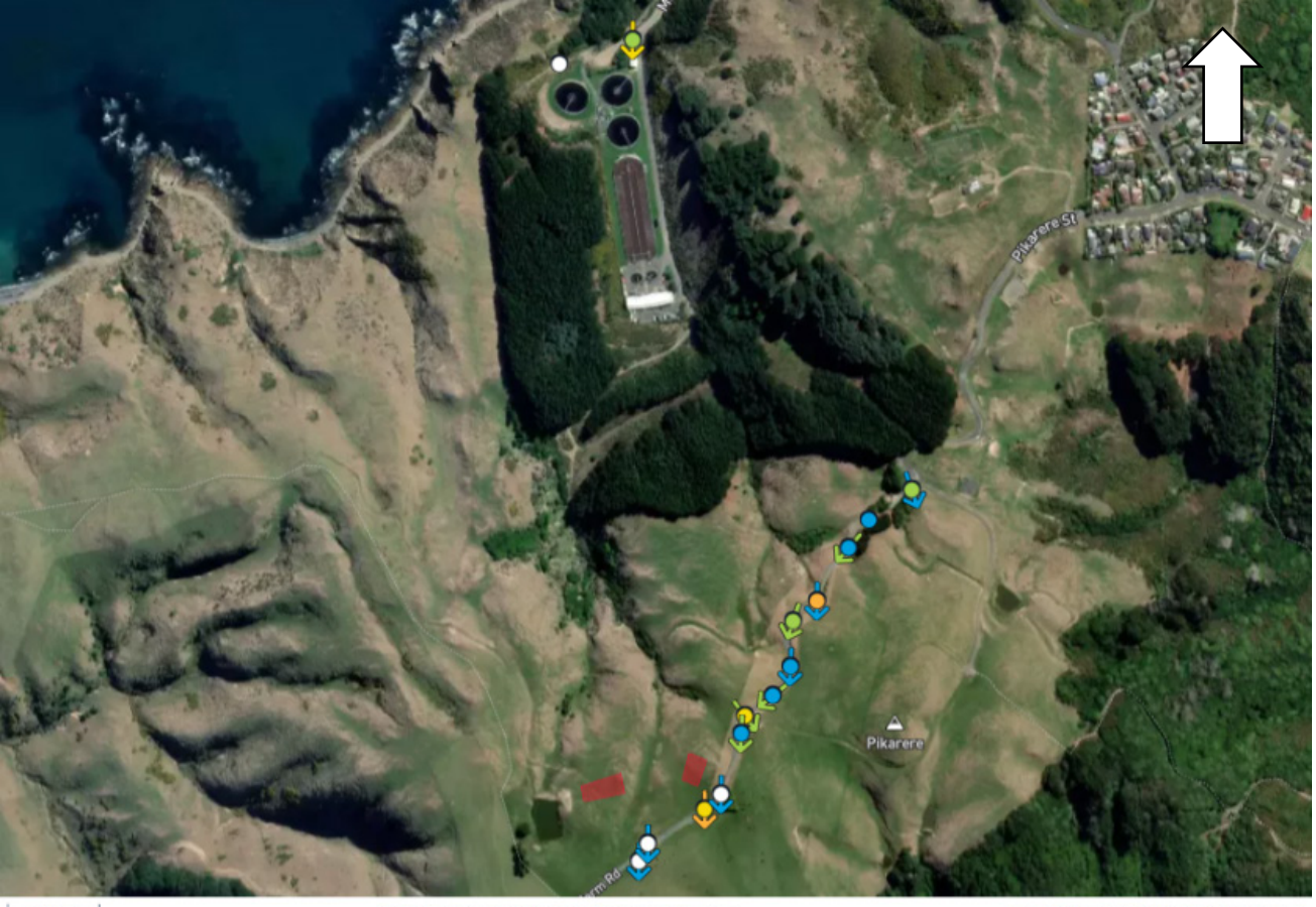
generated by plumemapper.com.au