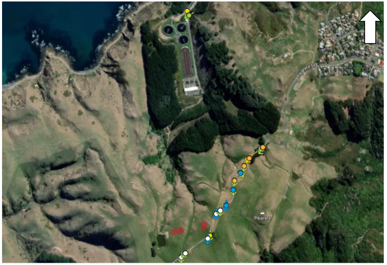
generated by plumemapper.com.au