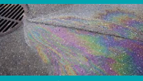
Oil and grease from motor vehicles.