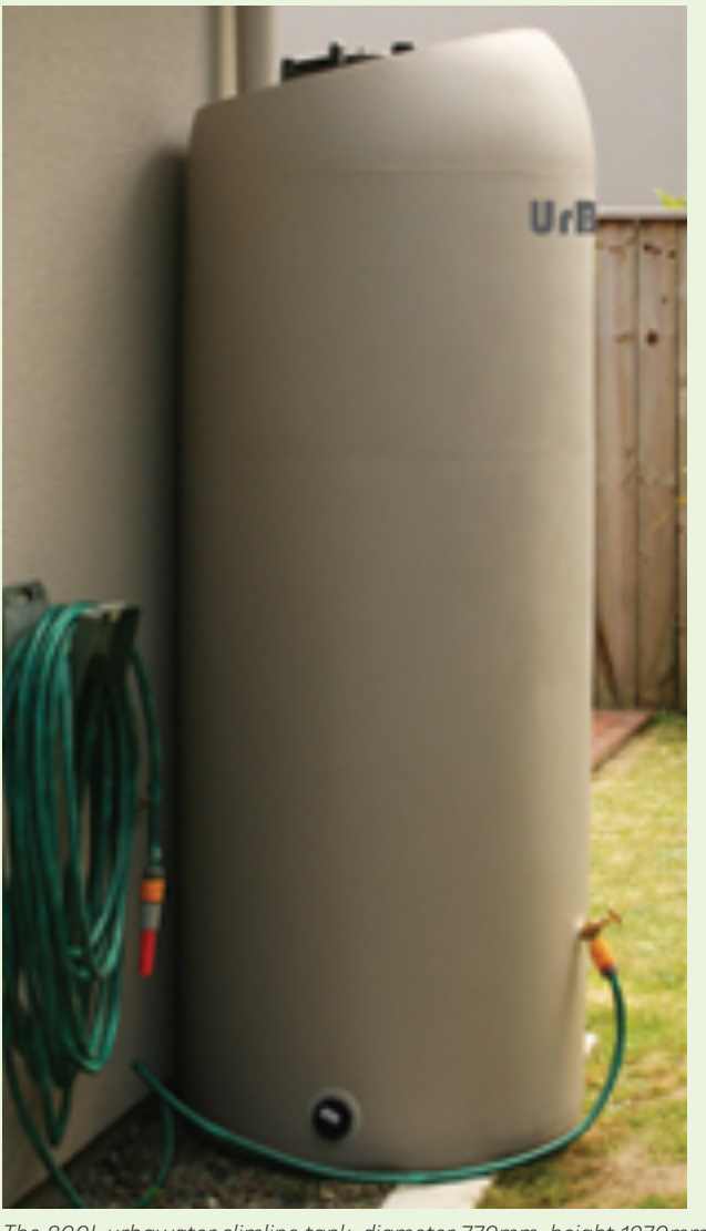
The 800L urbawater slimline tank; diameter 770mm, height 1970mm.

VIN 1 of 5 emergency water storage tanks!