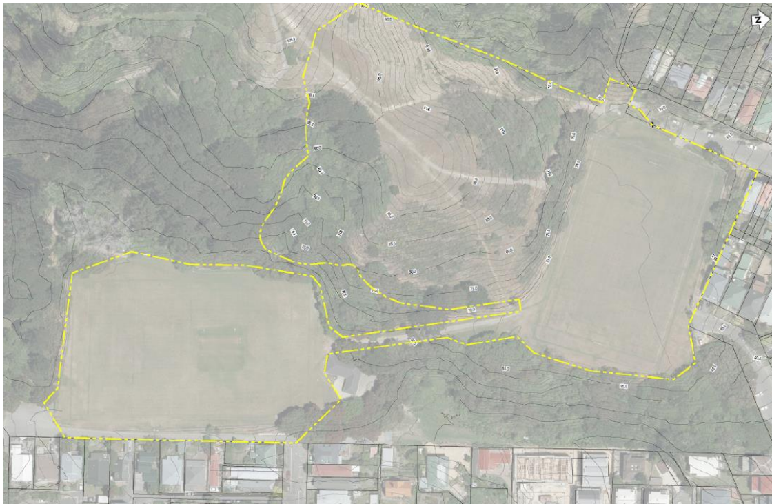
Figure 1: Approved licence area

The coverage of the Omāroro Reservoir licence is defined in Licence Condition LC.5 and comprises the area defined as 'Temporary Construction Area' shown in Figure 1 below: