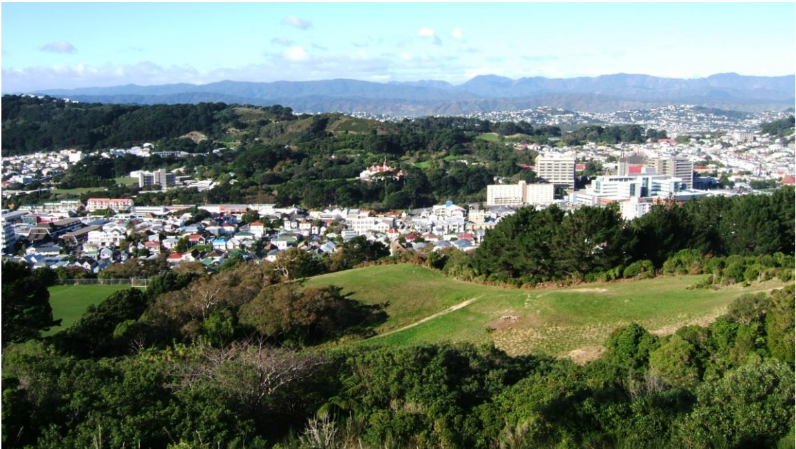
1 View down to reservoir site with Wellington Hospital to right and Government House in the centre