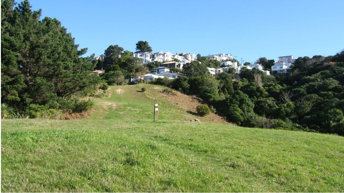
2 Reservoir site looking towards Brooklyn