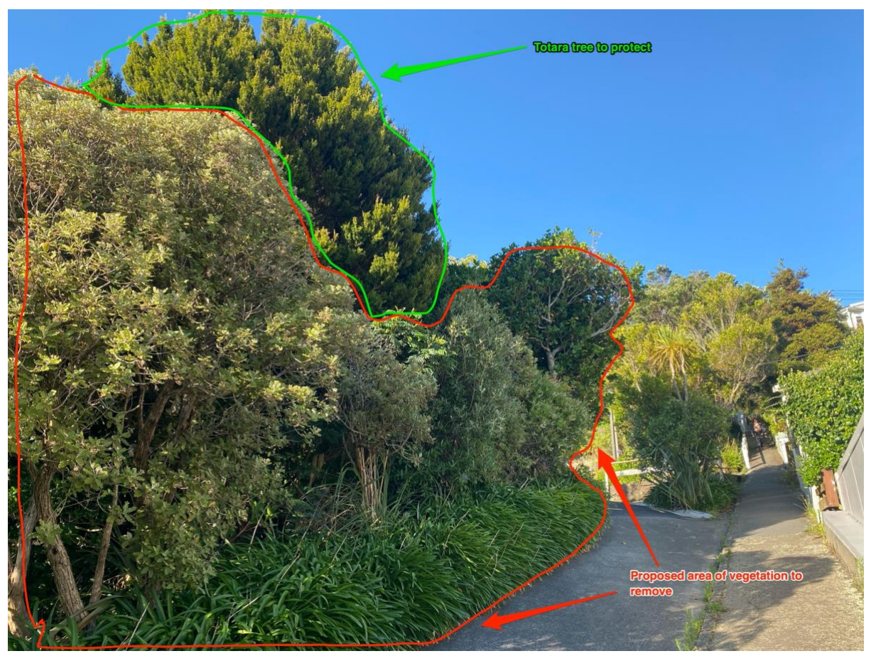
Photo 1 – showing current site, with Totara tree and proposed vegetation to be removed.