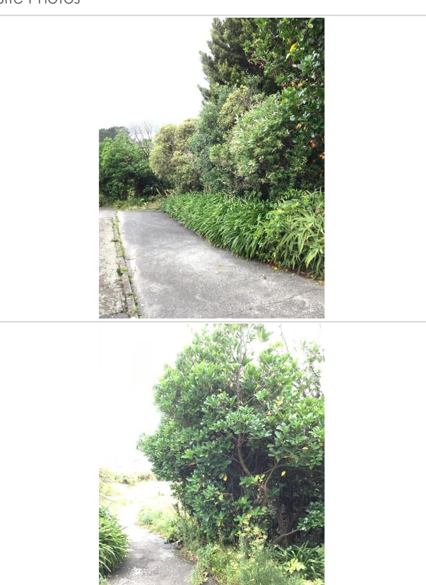
Photo 1: General vegetation currently existing within proposed footprint.