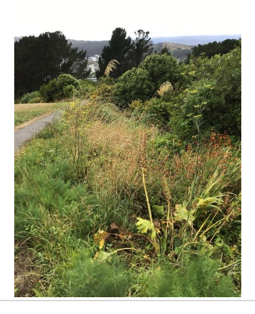
Photo 4: Dense weed layer at the northern extent of proposed footprint where there is currently no canopy.