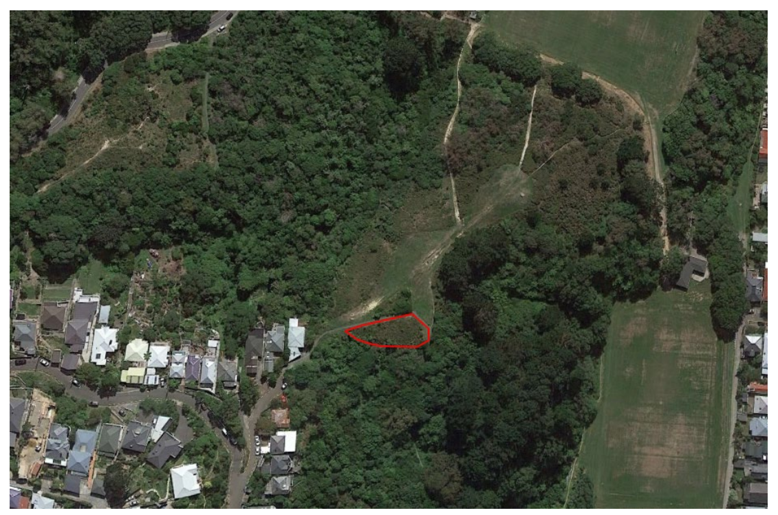
Figure 1: Location of proposed habitat enhancement, outlined in red.

The proposed site for terrestrial habitat enhancement is shown below in Figure 1. This location is outside of the affected area but is sufficiently close that any resident lizard populations would likely be contiguous with those in the footprint. The site is currently vegetated with gorse over rank grass. A lizard-proof fence (likely a polypropylene "silt fence", embedded in the ground) will be erected between the clearance area and the release site prior to salvage, to discourage any relocated lizards from moving back into the footprint.