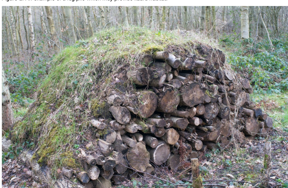
Figure 2: An example of a log pile which may provide lizard habitat.

The piles will be built in conjunction with staff at Wellington City Council who have offered to supply materials and labour. Depending on COVID-19 lockdown levels, we are aware that community conservation groups are also interested in being involved.