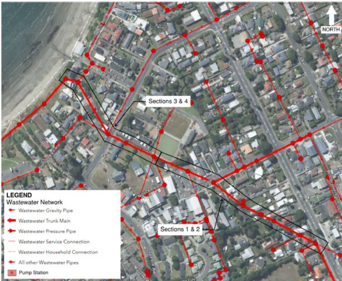
Figure 1: Catchment overview including Sections 1-4

In 2017, Sections 1 and 2 (approximately 320m in length) were relined using the trenchless technology ‘Cured in Place Pipe’ (CIPP) lining. Sections 3 and 4 (approximately 195m in length) were not renewed during 2017 due to budget constraints.