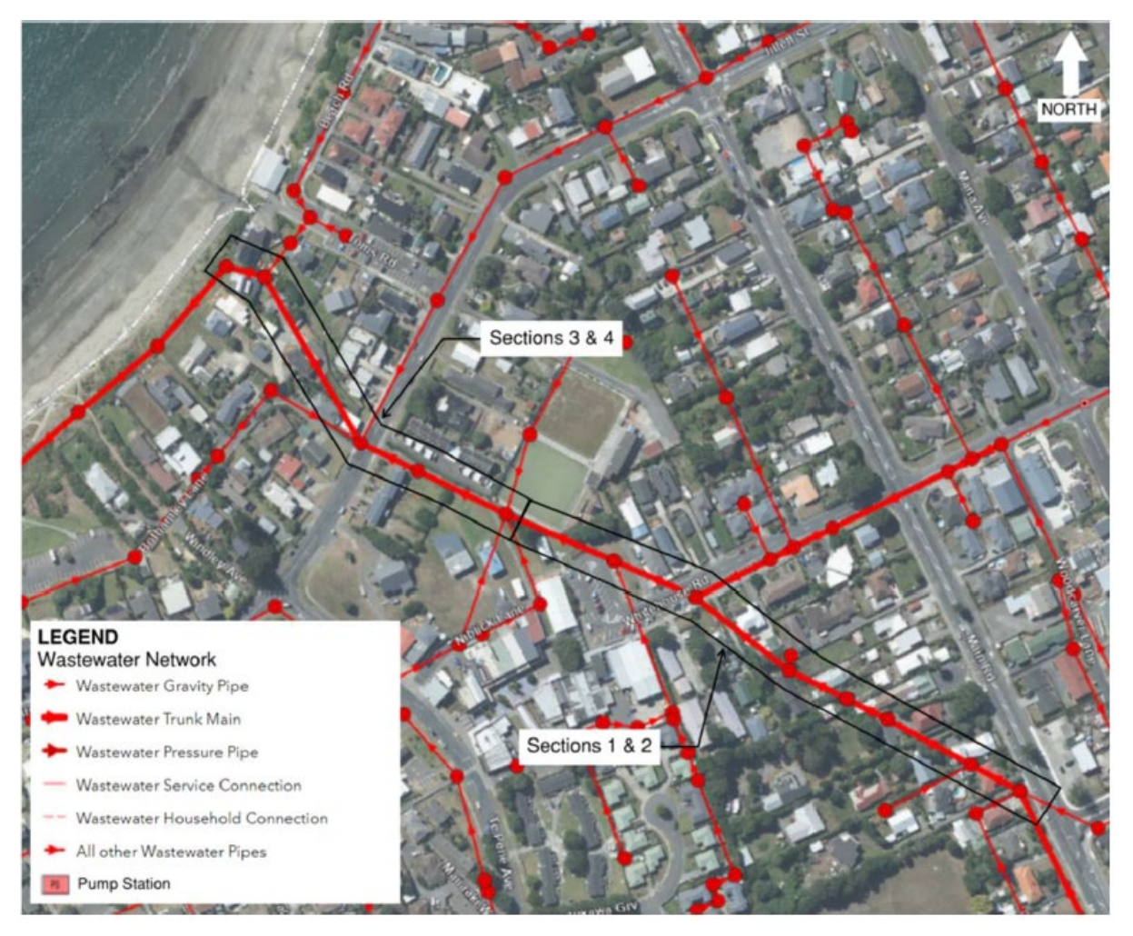
Figure 1: Catchment overview including Sections 1-4

In 2017, Sections 1 and 2 (approximately 320m in length) were relined using the trenchless technology 'Cured in Place Pipe' (CIPP) lining. Sections 3 and 4 (approximately 195m in length) were not renewed during 2017 due to budget constraints.